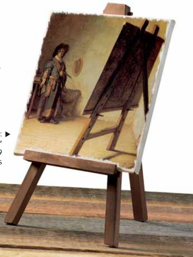
Illustration of the Original Rembrandt painting: ► Rembrandt: "The Artist in his Working Room" tablet picture 0,25 x 0,31 m, 1629 Boston, Museum of Fine Arts