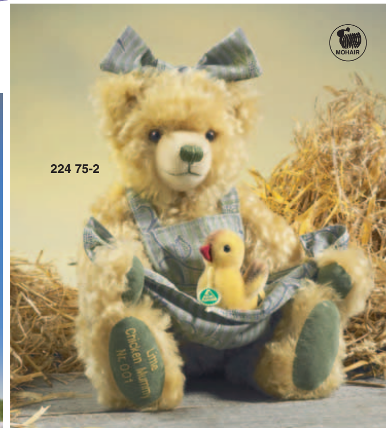
▲ Little Chicken Mummy with miniature chicken baby limited to 250 pieces – world-wide