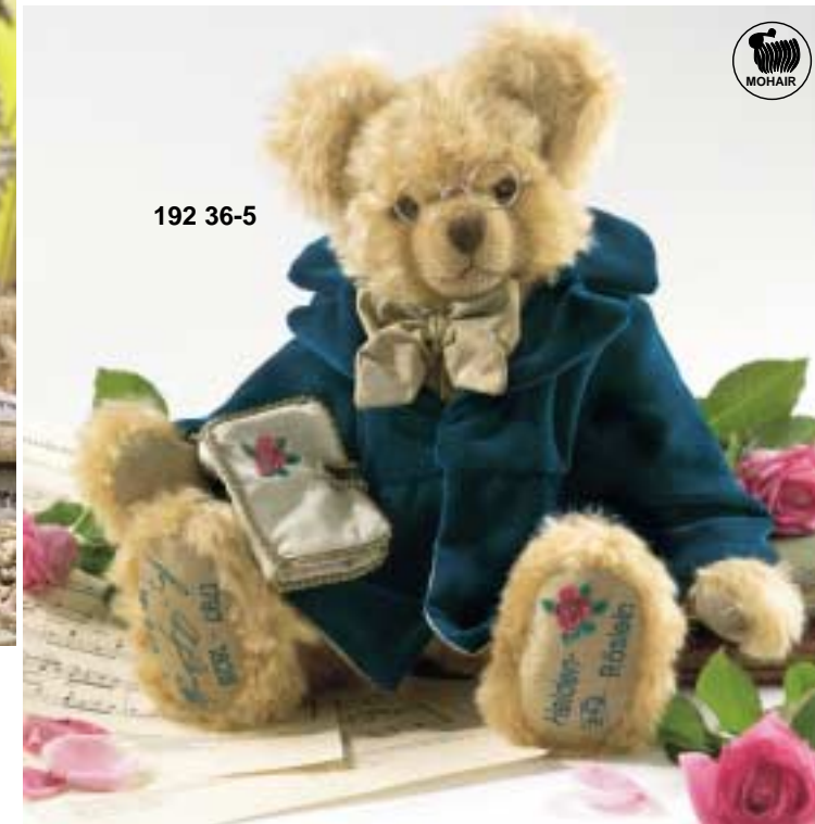
Franz Schubert with music „Heidenröslein“ by Franz Schubert European Edition - limited to 500 pieces