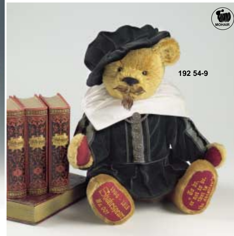
▼ William Shakespeare limited to 1000 pieces - world-wide