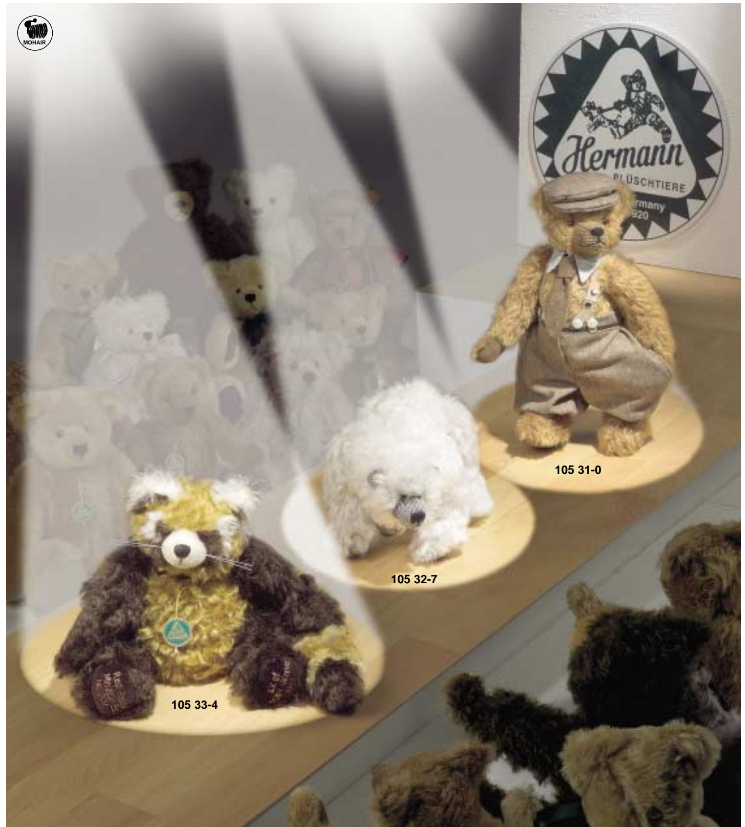
▲ Red Panda Miniature Edition small Version of the TOBY™ Winner 2001 limited to 1000 pieces world-wide