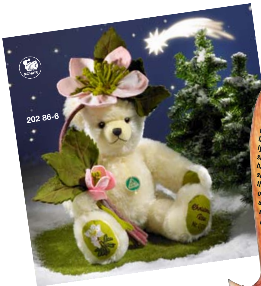
◀ “Christmas Rose” First in the HERMANN “Rose Series” limited to 500 pieces – world-wide