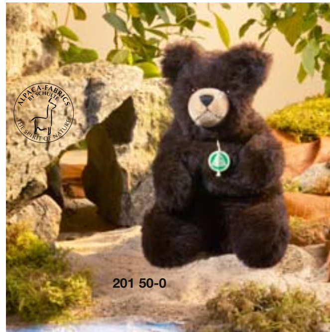
The lively kind of playing – an old playing idea from the 1970s remade and new designed

Brown Bear Baby ► limited to 250 pieces world-wide