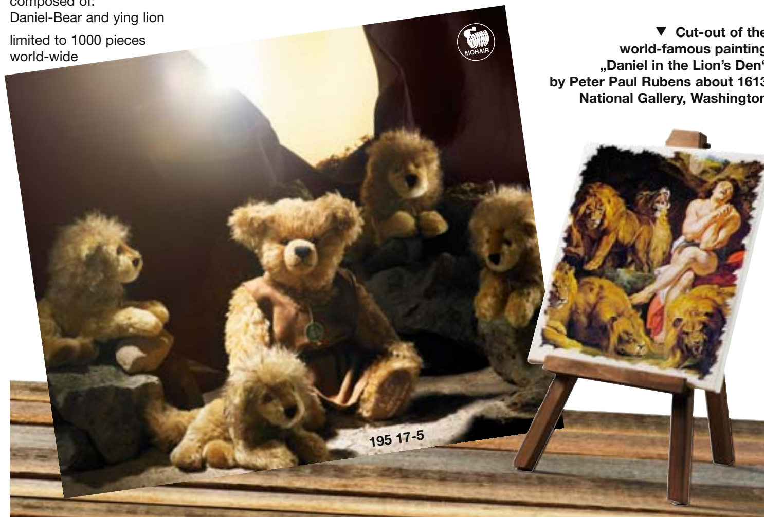
▼ Cut-out of the world-famous painting „Daniel in the Lion's Den“ by Peter Paul Rubens about 1613 National Gallery, Washington